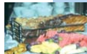
Altogether, the participants ate 43 kg of cake.