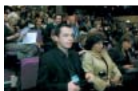
Project Managers from EU neighbour countries also showed much interest. Together almost 100 participants from Russia and Belarus attended the Conference.

Most Conference visitors were partners of INTERREG projects or are planning to apply for funding for cross-border cooperation projects in the future.